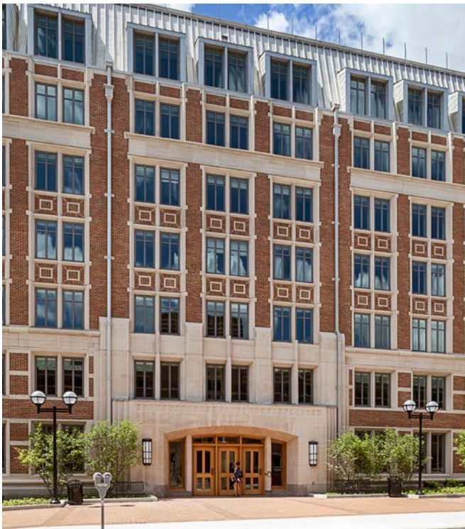
2016 Winner: University of Michigan Munger Graduate Residence Hall.