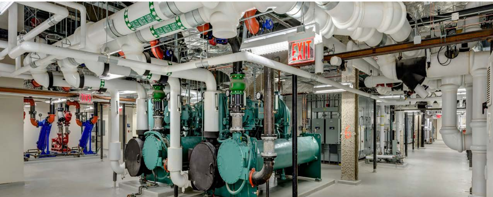
2016 Honorable Mentions, The Globe Building Outdoor Adventure Center (top) and Detroit Medical Center Heart Hospital.