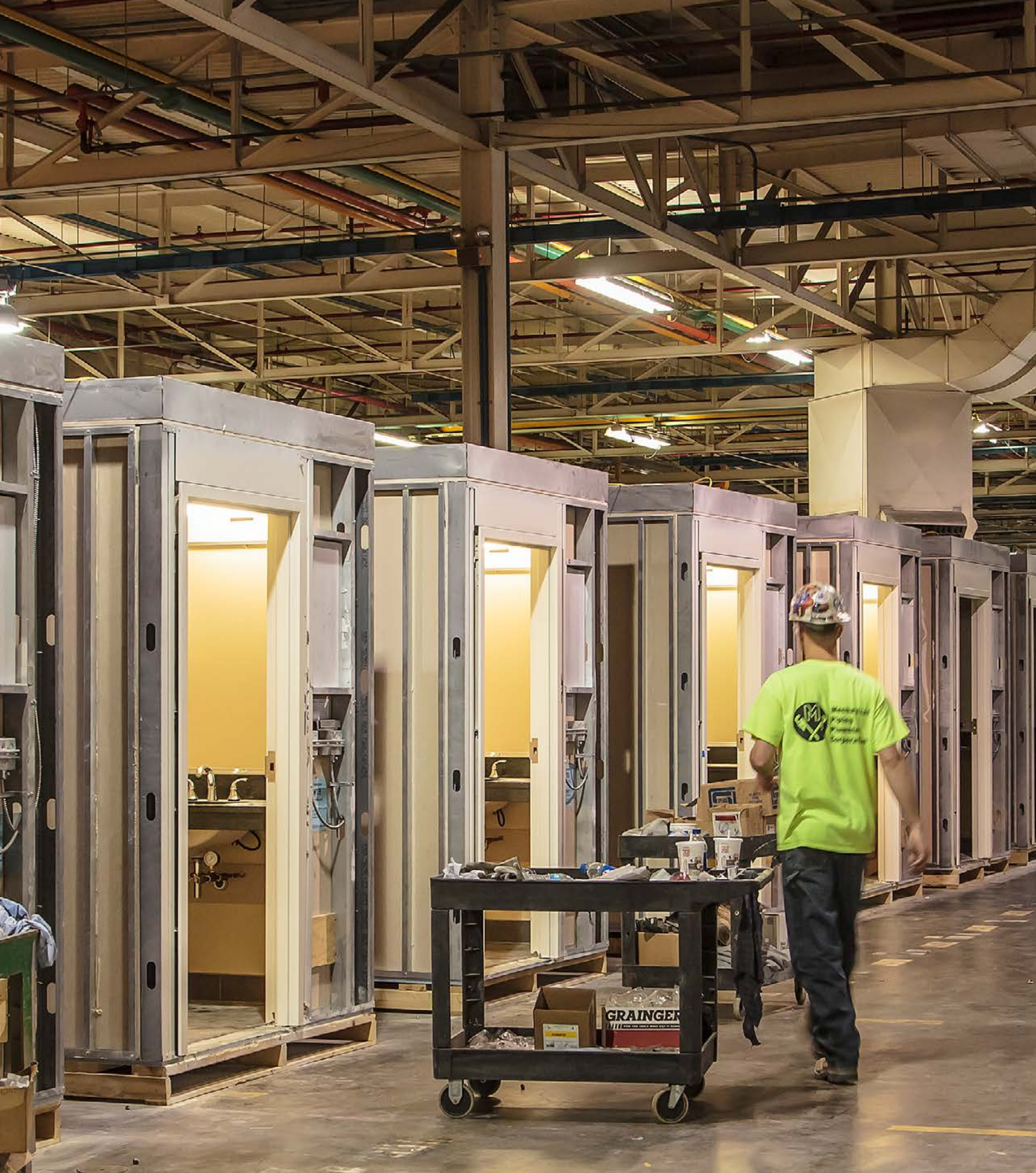
ABOVE: 2016 Winner University of Michigan, Munger Graduate Residence Hall