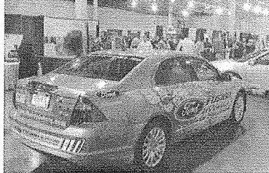
The new Ford Fusion Hybrid that went 1,000 miles on one tank of gas, on display at the DTE Energy-Engineering Society of Detroit Energy Conference at Rock Financial Showplace Tuesday.

E-Mail Story Print Story ShareThis Text Size: A A A